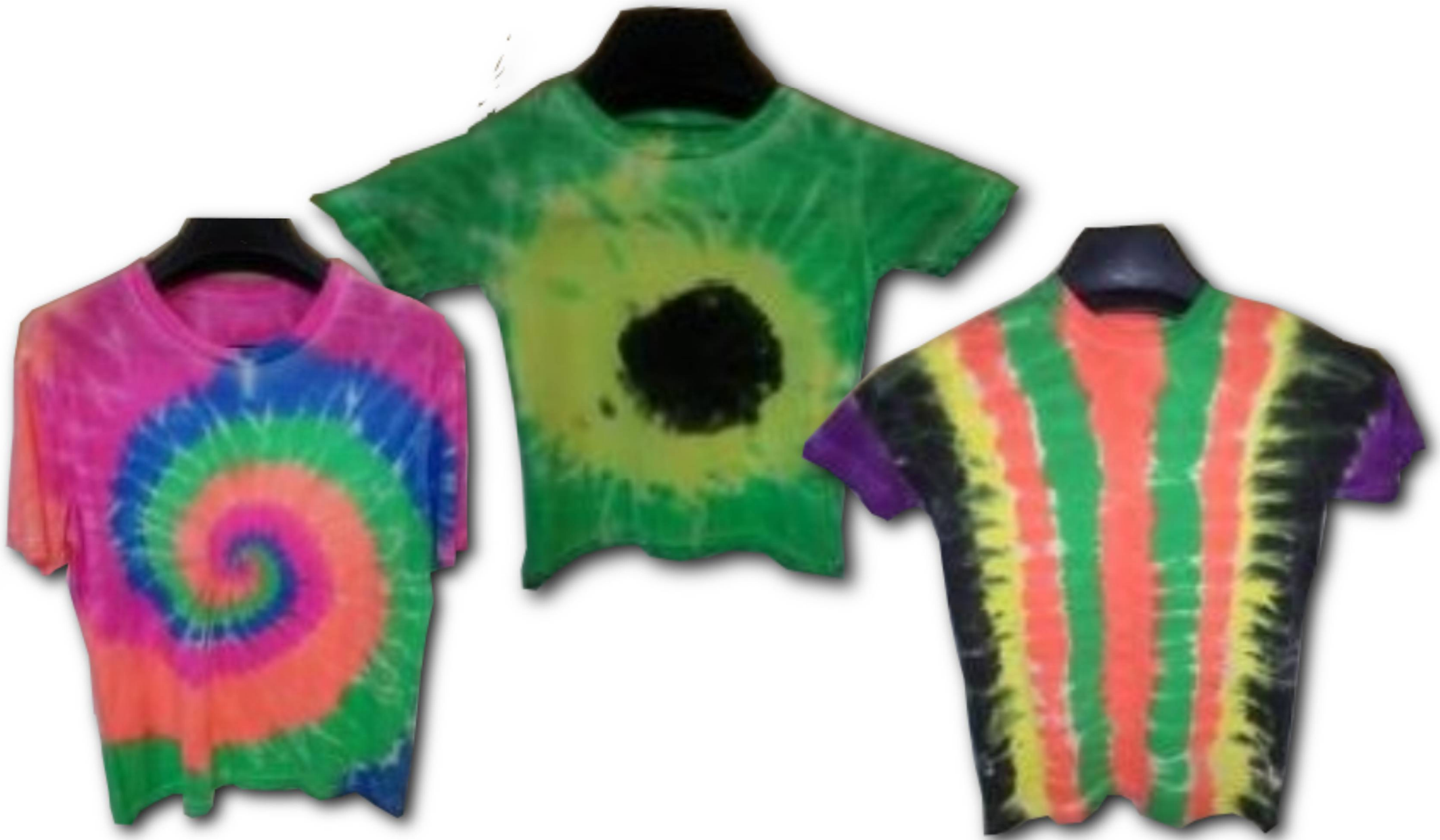
Tie and dye