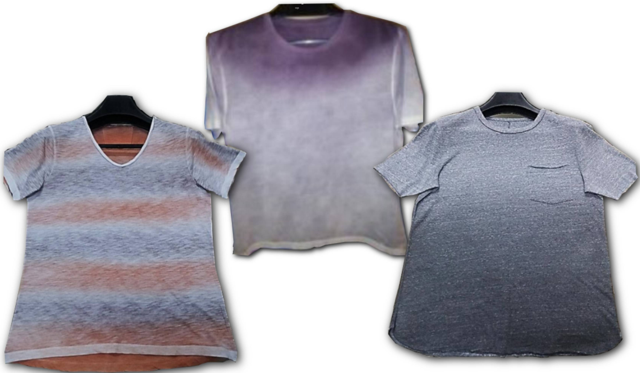
Sun burn spray wash