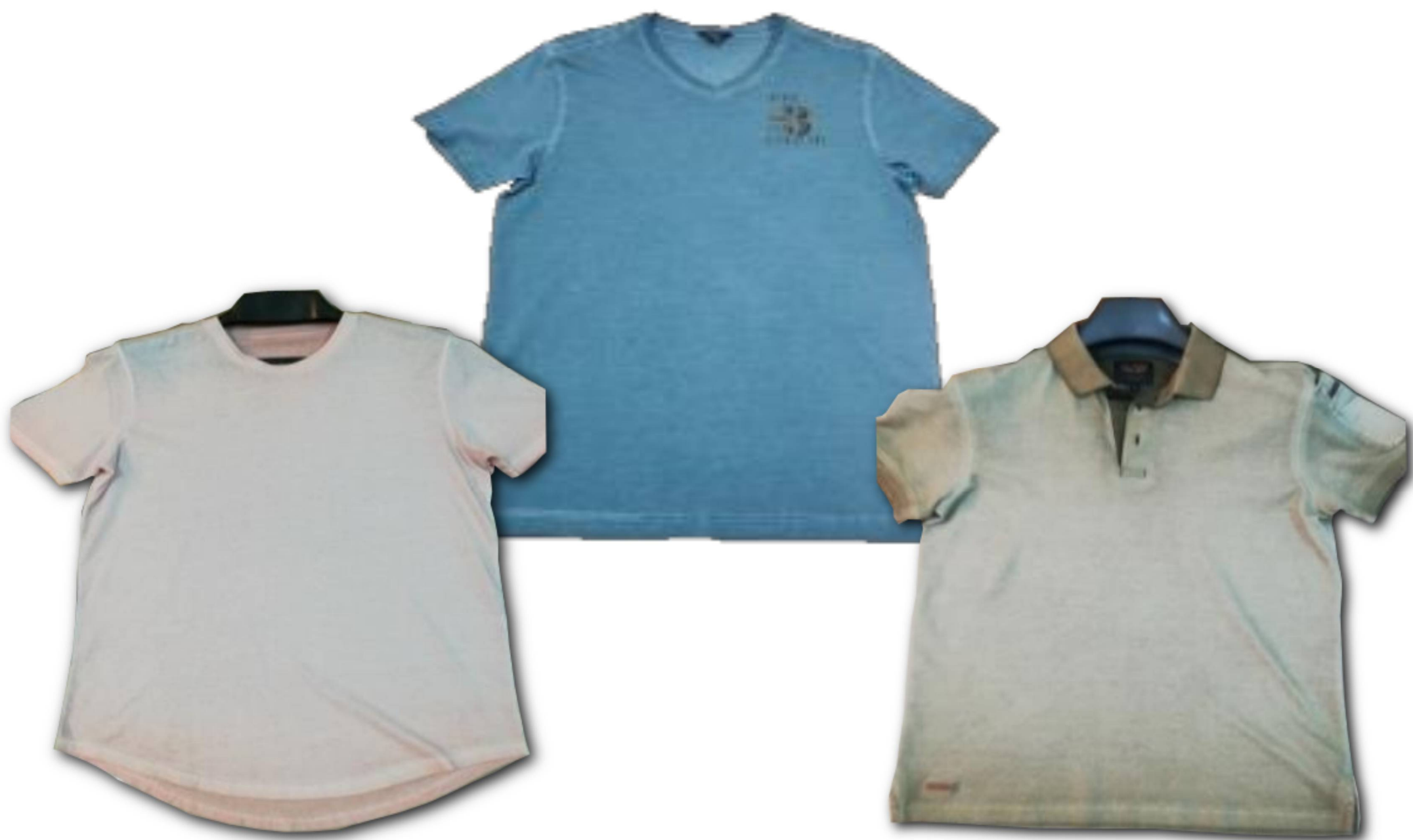
Cold pigment dyeing