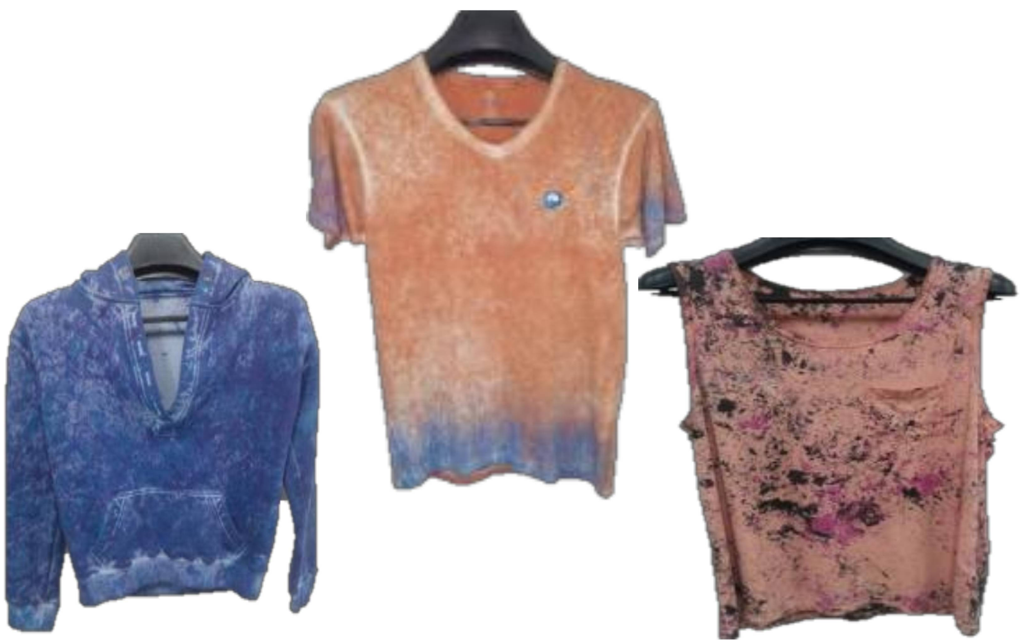
Stone garment dyeing